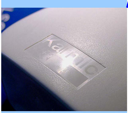
Direct to-object: Here, by injection blow-moulding on OPP (object by ADOP, France)