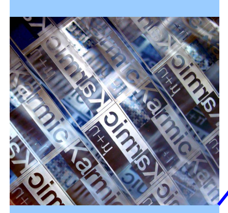
Web-fed: Here, by rollembossing on PC "Makrofol" film. (roll-embossing by 3D AG)